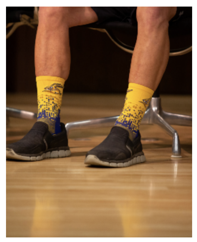
Tom Bezdichek's Jackrabbit socks may not have stole the show but they certainly made an impression at the club's 50th anniversary gathering at the South Dakota Art Museum auditorium Sept. 26.

But the showstopper had to be the snazzy Jackrabbit socks worn by the dapper Bezdichek.